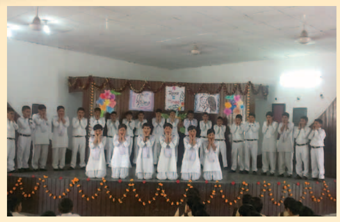
Class item by VI A

her emotions. Luckily and happily we got 10 best poems and displayed them for others to read and enjoy.