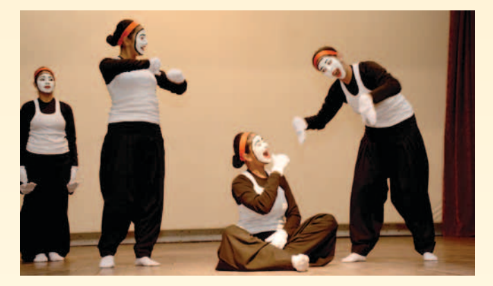
A mime presented by GVM girls

a street play and a mime on 'Beti Bachao, Beti Padhao', a theme close to the hearts of all.