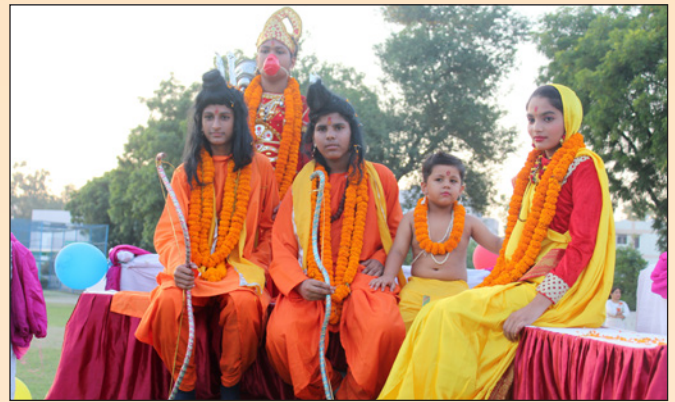
Dussehra celebrations at MNSS Rai

Dussehra celebration, which was a part and parcel of the religious traditional celebrations followed in the school since the inception, revived with a lot of excitement. Our Principal & Director, who as a student used to celebrate Dussehra in the school with a lot of zest & zeal and with religious passion, again started in the same manner. For the present students, it was a different experience to celebrate such a festival here, so it was exciting and invigorating. They enjoyed each and every moment of the function.