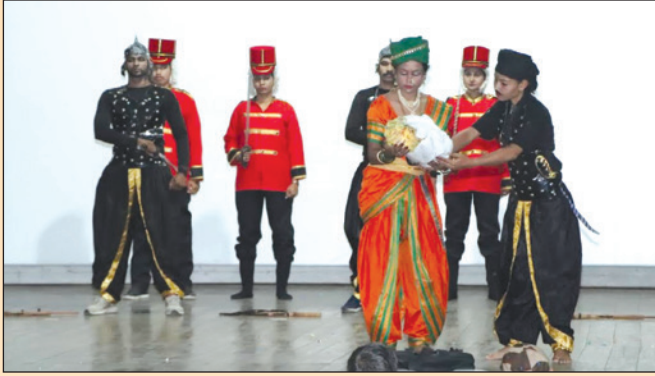
A delegation from CISF Delhi presenting a cultural programme in MNSS Rai

duties as inspiration. The Prime Minister Flagged off the Padyatra (Dandi March) from Sabarmati Ashram Ahmedabad on 12 March, 2021 and inaugurated the curtain raiser activities of the Mahotsav. He also launched various other cultural and digital initiatives for India@75 Celebrations.