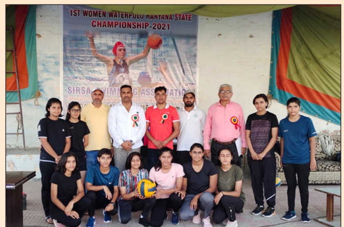
MNSS Rai Girls' water polo team

Inter-House sports competitions, discontinued due to pandemic, resumed on 08 October, 2021 with