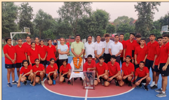
Surya House with S.N. Ahlawat Inter House Basketball Championship trophy

Inter-House Hockey Championship was followed by Inter-House Football Championship. Likewise, girls and boys participated from their respective houses with zest and zeal. They played all out putting in their heart and soul. At the end of the competition, it was again the Indra House which snatched the championship and Soma House got the Runner Up position.