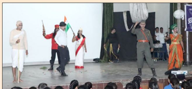
A delegation from CISF Delhi presenting a cultural programme in MNSS Rai

The Government of India decided to celebrate 75 years of Independence of India with great fervor and excitement as a Jan Utsav in the spirit of Jan-Bhagidari. So they decided to organize various programmes/ series of events across the country in the name of Azadi Ka Amrit Mahotsav. The Prime Minister Sh Narendra Modi reiterated five pillars i.e., Freedom Struggle, Ideas at 75, Achievement at 75, Actions at 75, and Resolves at 75, as guiding forces for moving forward keeping dreams and