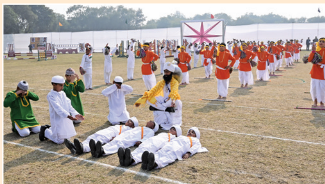
Dance performance on unity in diversity