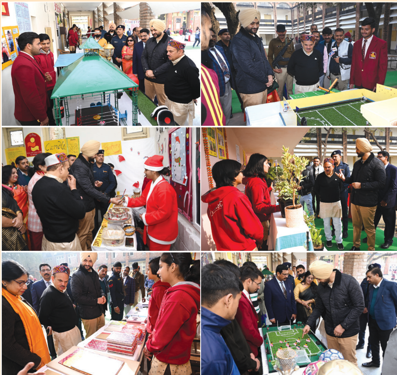
Annual Day Exhibition

the cake was the work done by children of IP group. They not only captured various beautiful moments while children were busy in their respective hobby groups but also presented it in the form of PPT in computer lab. The first e-magazine of MNSS, Rai 'Techno Rai Venture' was also launched by the P&D on this occasion.