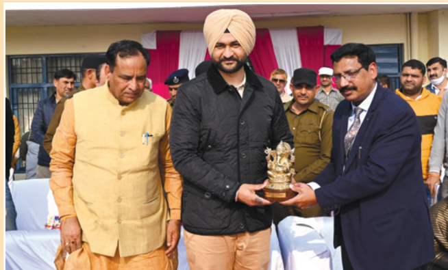
Glimpses of Annual Day function