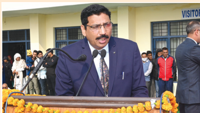
P&D presenting the school annual report